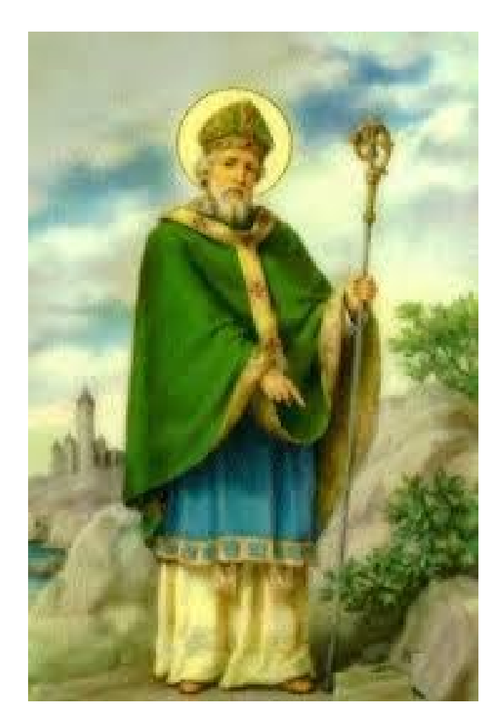
March 2, 2024

www.dcsppc.org | dcsppc13@gmail.com | Like us on Facebook PO Box 1352 | Wappingers Falls | NY | 12590 | 914-469-6661